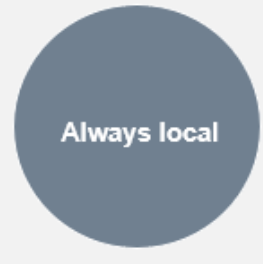
Figure 3: Local benefits test classifications

Goods and services that, by their very nature, are supplied locally.