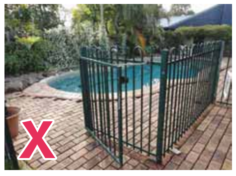
A gate cannot be tied or propped open when not in use and must self-close from any position.