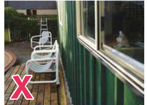
Windows that provide easy access to the pool area must be fixed permanently closed.

Louvres that create a gap of more than 100 millimetres do not comply.