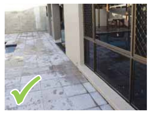
These windows have fixed security screens.