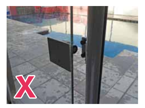
The gate or components may need to be adjusted or replaced to ensure the selfclosing mechanism works properly.