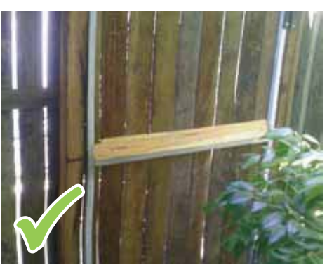
A minimum 60 degree angled wedge fillet along the horizontal rail eliminates a foothold.