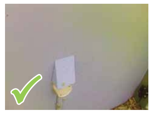
A power outlet has been shielded appropriately.