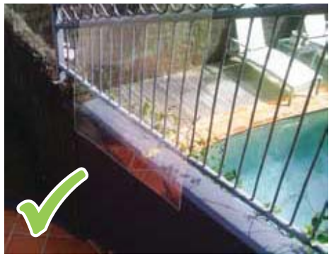
A flat polycarbonate sheet can be used to shield a climbable object.