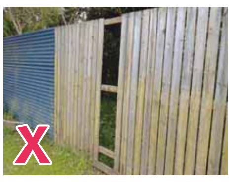
Gaps in a fence over 100 millimetres can provide easy access to the pool area.

A fence in disrepair can lower the effective height of the barrier or provide a gap for a child to enter the pool area.