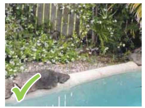
This garden bed does not reduce the effective fence height.

*If the work involves more than 2.4 metres of barrier or more than two posts, a non conformity notice (Form 26) from a pool safety inspector is required before work commences.