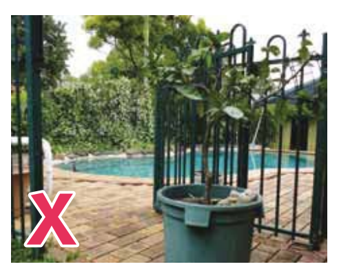
This gate is being held open by a pot plant, which could also be used to climb into the pool area and must be removed.

A ladder is a climbable object and must be removed. The vegetation shown is acceptable as it is not climbable.