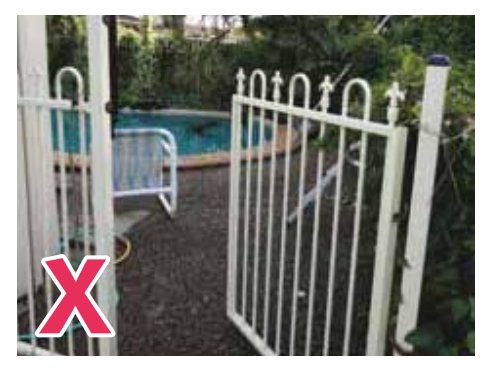
Inward opening gates must be modified to open outwards.