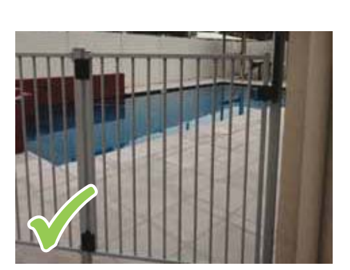
This gate is self-closing and in good condition.