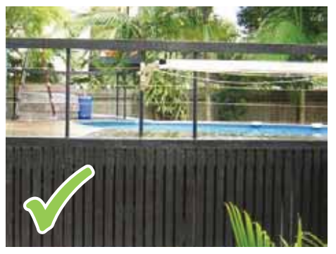
This deck bracing has been covered up with vertical palings less than 10 millimetres apart.