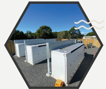
Large-scale battery at Bargara Substation

The facility will help boost energy supply, support local jobs and drive down power prices. When fully operational in 2026, ESI aims to have up to 500 highly skilled employees and contractors working throughout regional Queensland.