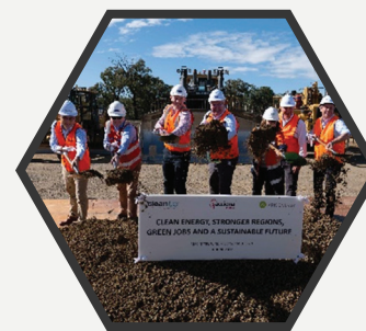
MacIntyre Wind Farm sod turning ceremony

With the capacity to supply the equivalent of nearly 700,000 homes, the project will substantially boost renewable energy supply in Queensland helping our industries, businesses and communities to achieve their sustainability goals.