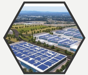
Artist's impression of the supernode

Large-scale data storage will support new jobs and allow the region to continue to boom in the lead-up to the Brisbane 2032 Olympic and Paralympic Games.