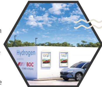
Artist's impression of the hydrogen refueller

The hydrogen refuelling station will have capacity to refill a hydrogen car in three to five minutes.