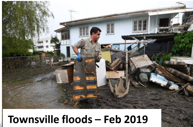
Townsville floods – Feb 2019