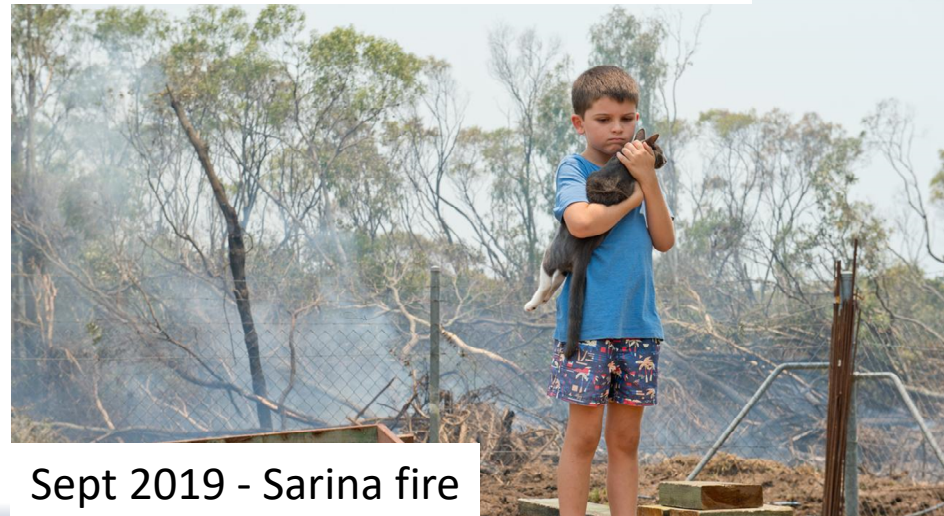
Sept 2019 - Sarina fire