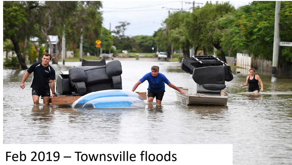
Feb 2019 – Townsville floods