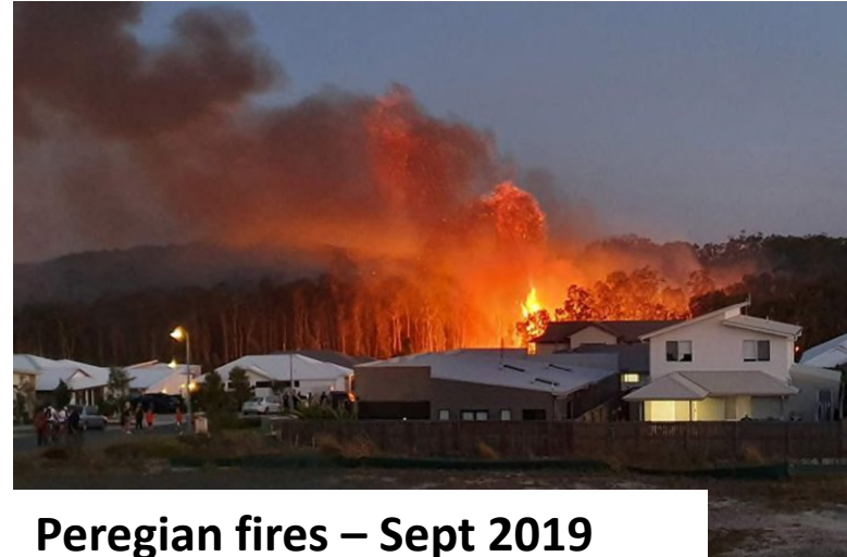
Peregian fires – Sept 2019